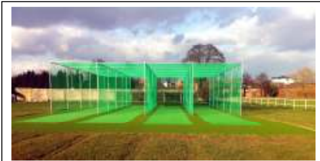
Four bay practice area at Stourport Cricket Club

As part of the ECB pitch re-approval process user assessment forms were compiled by Stourport Cricket Club who has two Premier and two Test Match system pitches. Over 250 forms were completed during the 2013 season by players of all abilities.